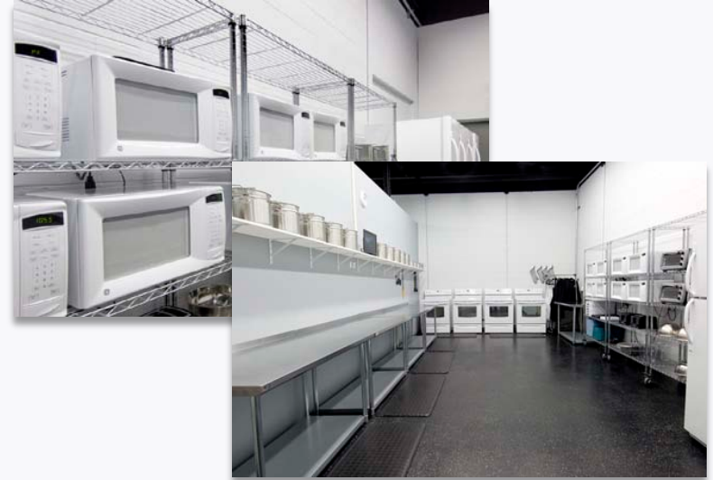
Plenty of storage and countertop space