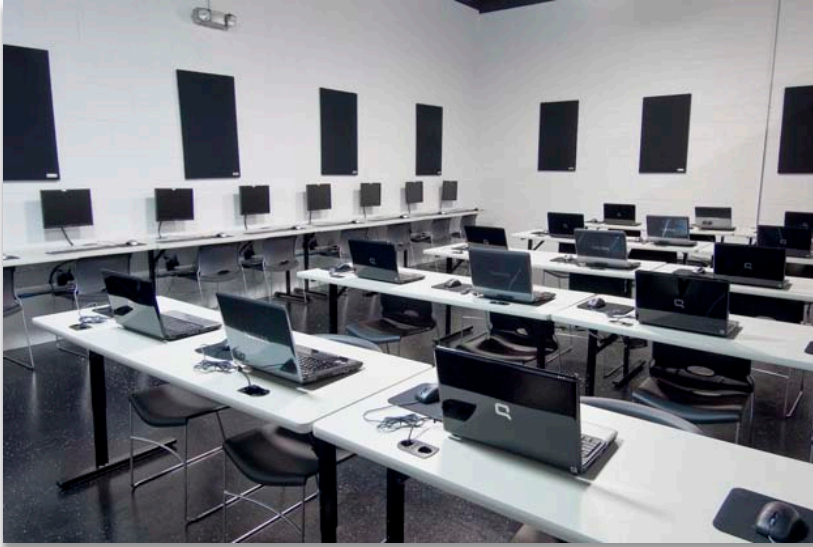
Sensory Lab seats 30 per session